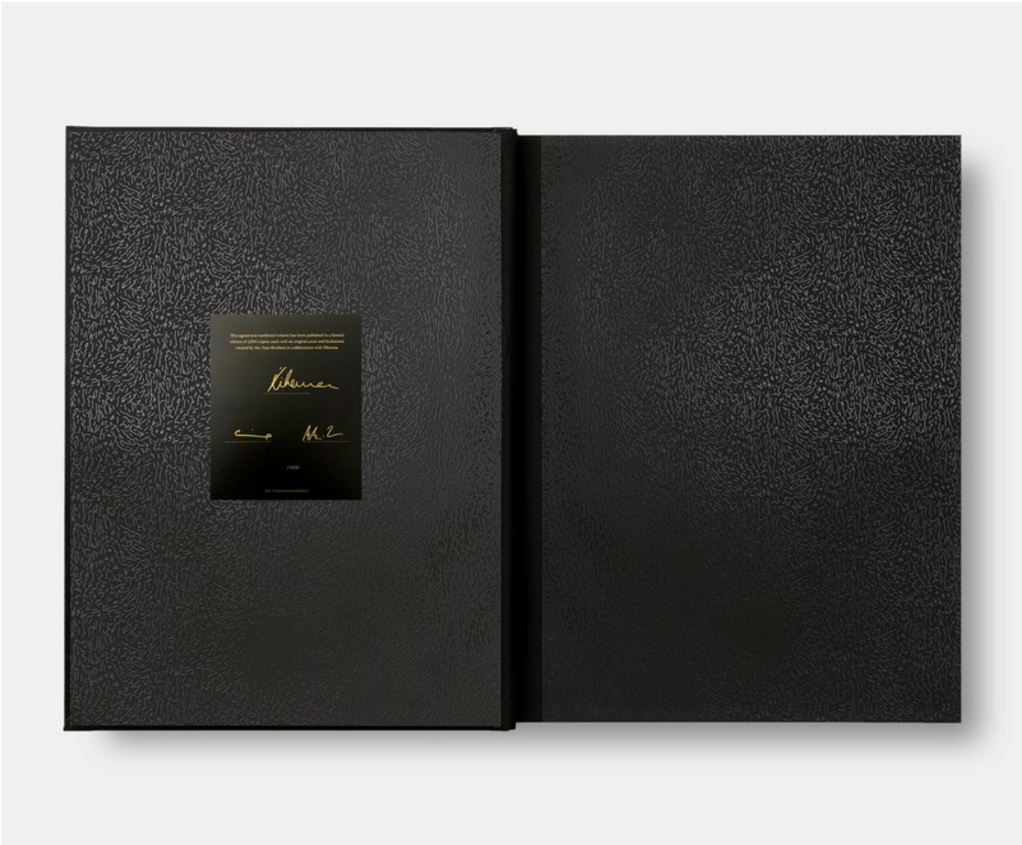
The endpapers in the Rihanna : Luxury Supreme edition.