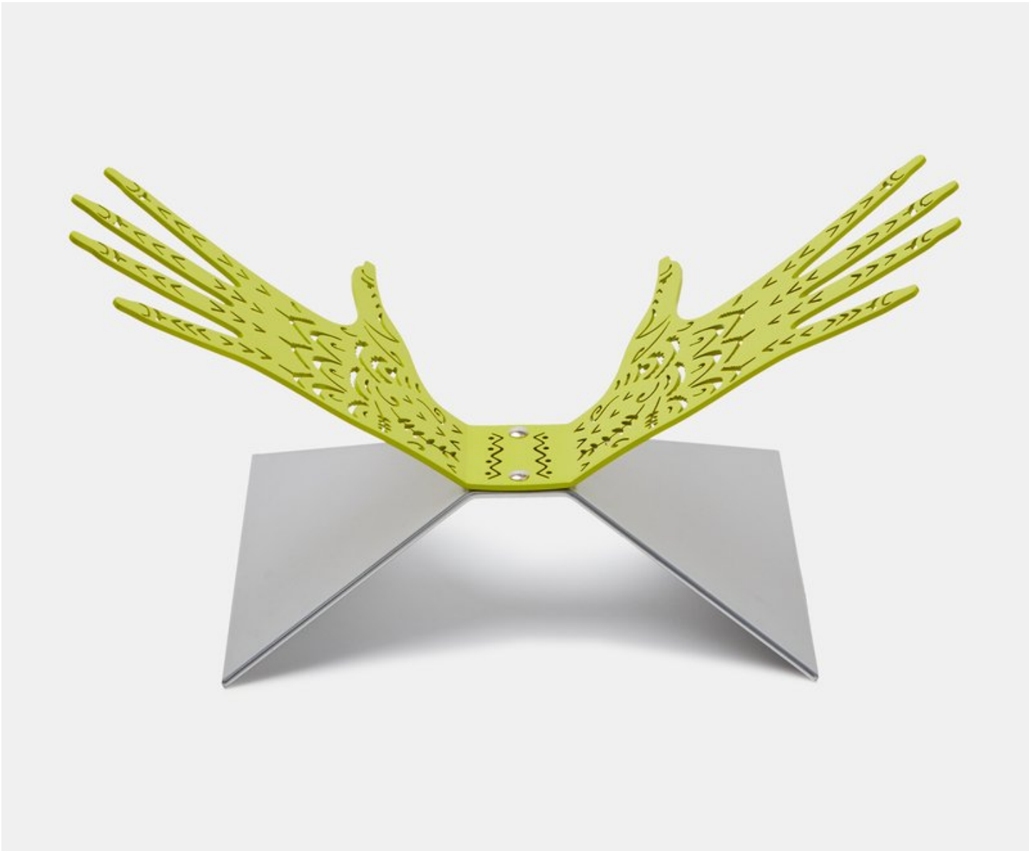
This limited edition is a large-format, 504-page book with 1,050 color images and features “This Sh*t Is Heavy,” a custom tabletop bookstand created in collaboration with The Haas Brothers. It’s available on Artspace for $175.